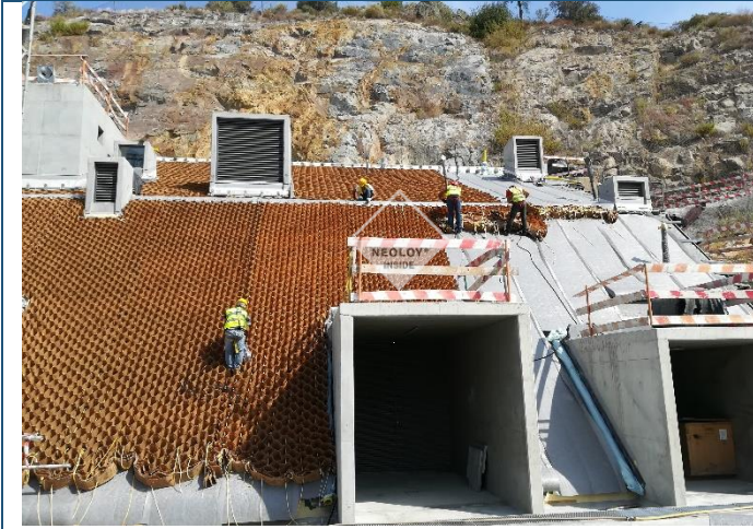
Neoloy sections opened downslope from crest anchors