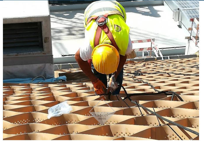
Tendons anchored at crest and toe inserted in cells