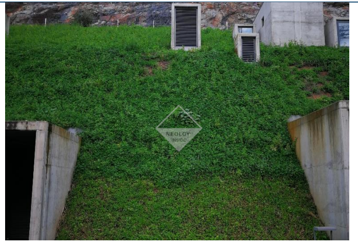
Vegetated slope – visual aesthetic & erosion control