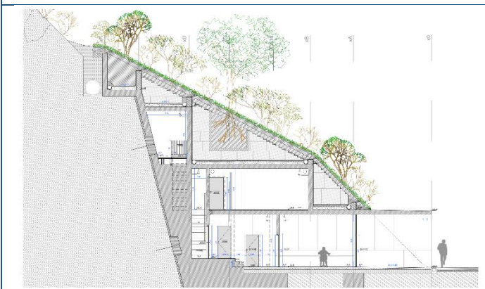
Architectural section drawing of technical station