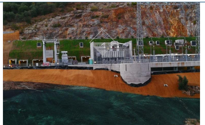
Completed green roof slope protection