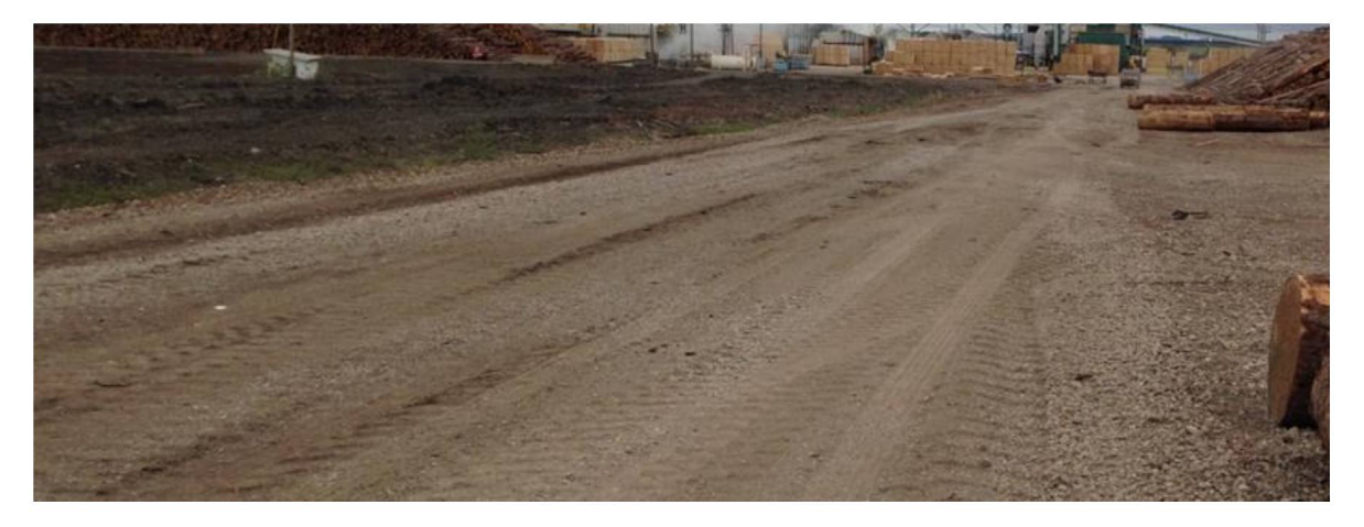
Figure 6. Access inside the CANFOR logging yard