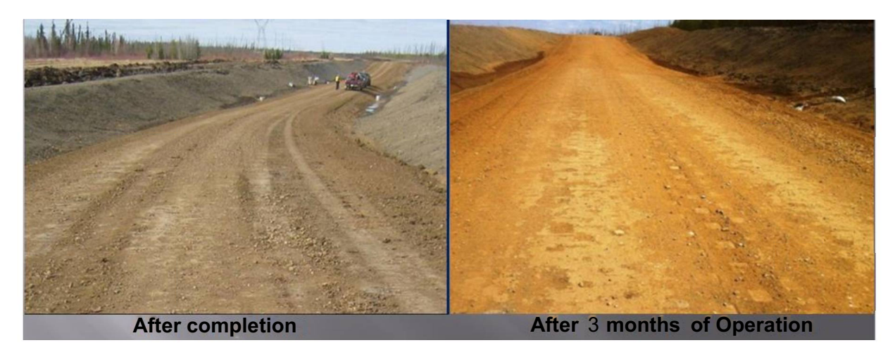
Figure 9. Cause Way for Grizzly Oil Sands.