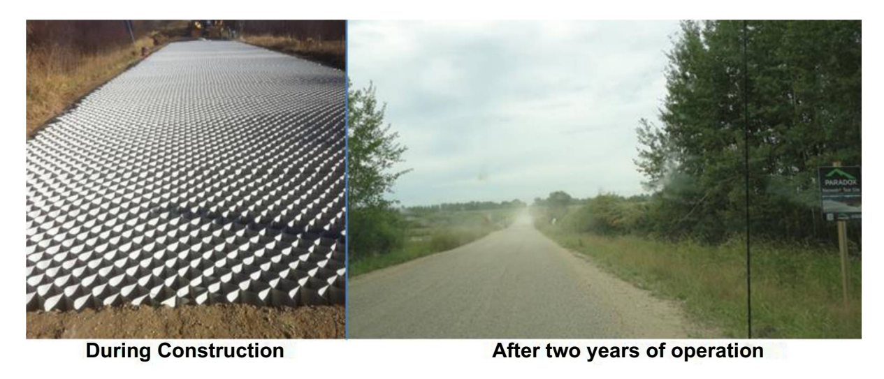
Figure 7. Range Road 540 in County of Lac St Anne.