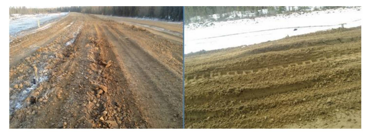
Figure 4. Failure after exceeding the design traffic at the J-Hook road

Figure 3. Driving condition on C-road before and after installation of Neoloy Geocell reinforcement